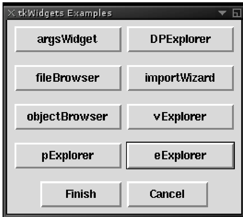
Figure 1: A snapshot of the widget when the example code chunk is executed

This vignette provides more detailed descriptions of the following three widgets.